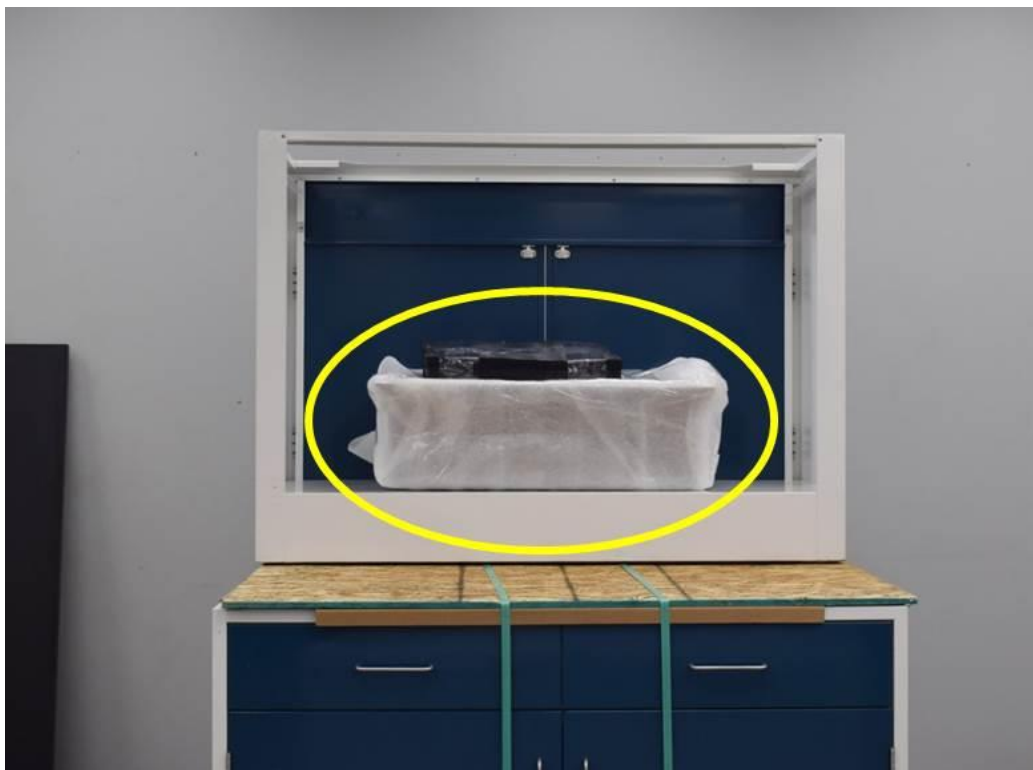
Locate the sink assembly