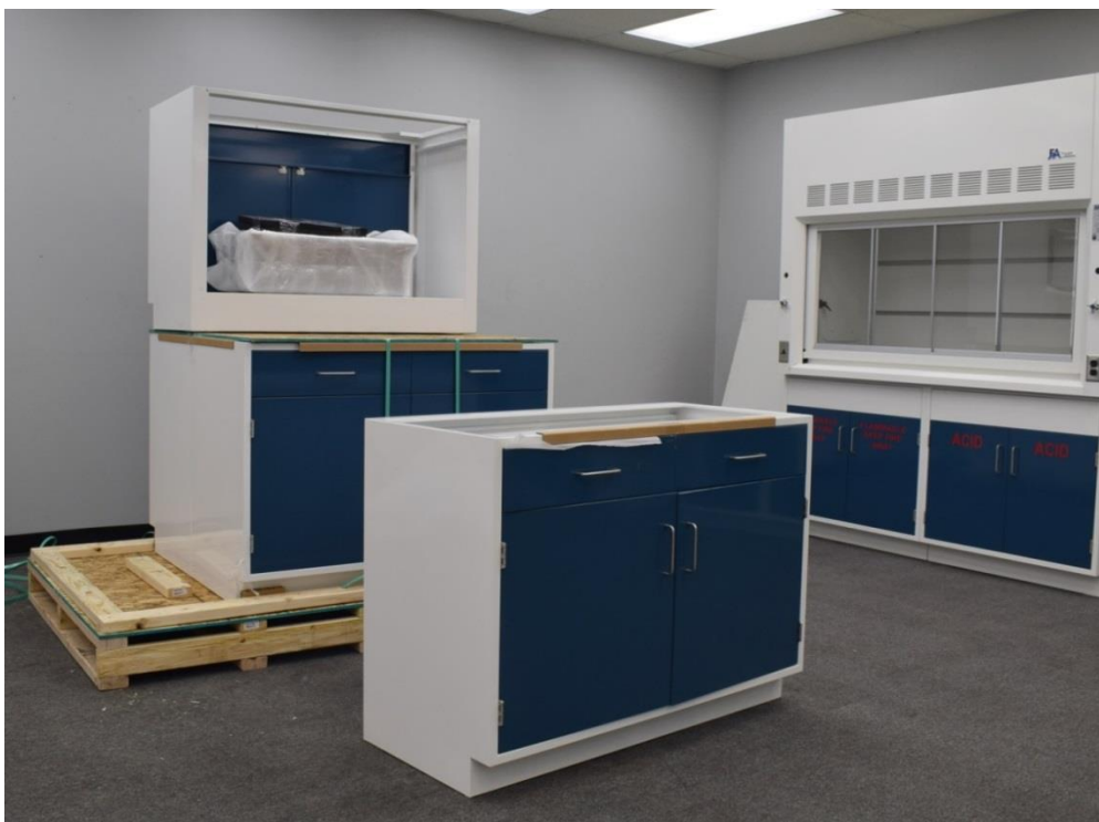
Cut and remove banding. Start un-stacking cabinets